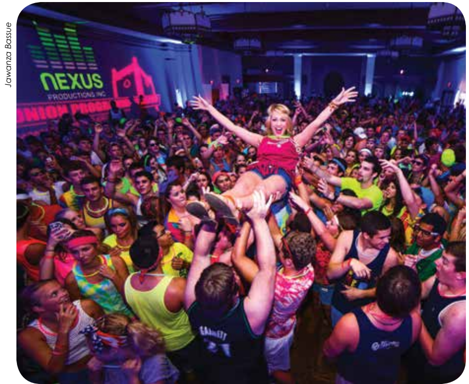
New students dance the night away at UPB's Retro Night, part of Camp Crimson orientation camp.