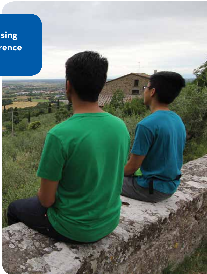
Students take in the view near Arezzo, Italy.