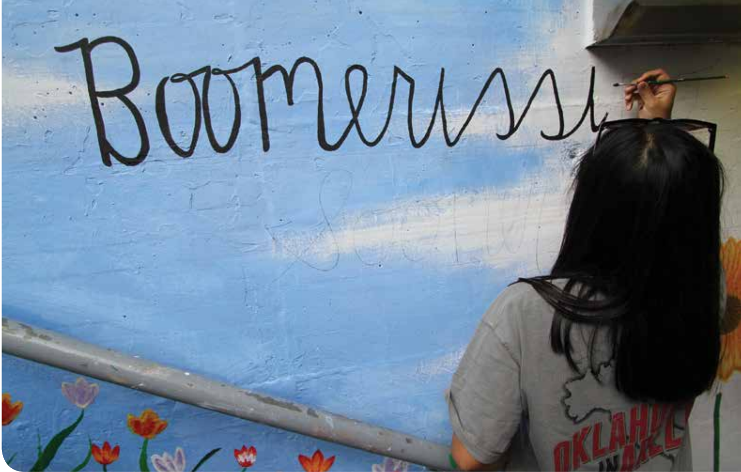
A student paints on a wall in a train station in Arezzo, Italy, as part of a community beautification project with the President's Community Scholars.