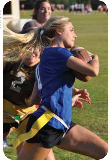
Students take a break from studying to play Intramural Flag Football.