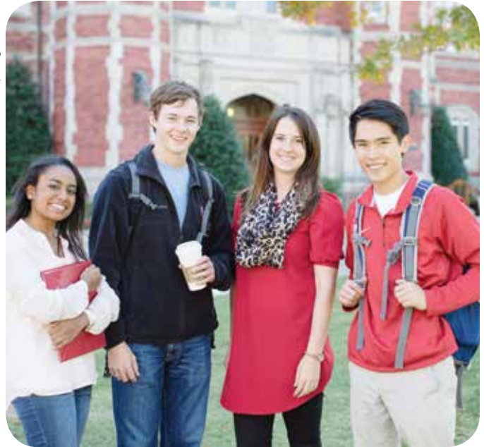
Before heading to class, students gather in front of Evans Hall.