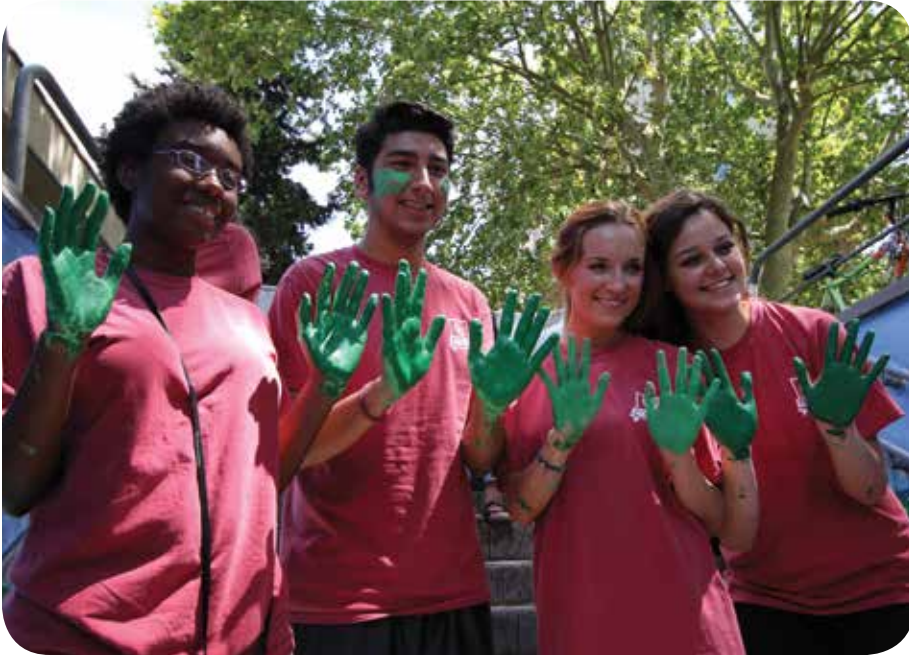
President's Community Scholars participate in a community beautification project in Arezzo, Italy.