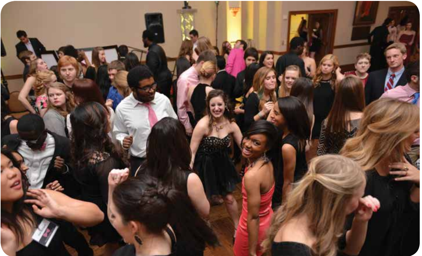
Students support breast cancer awareness at the Pink and Black Ball, a Women's Outreach Center fundraiser for the Susan G. Komen Foundation.