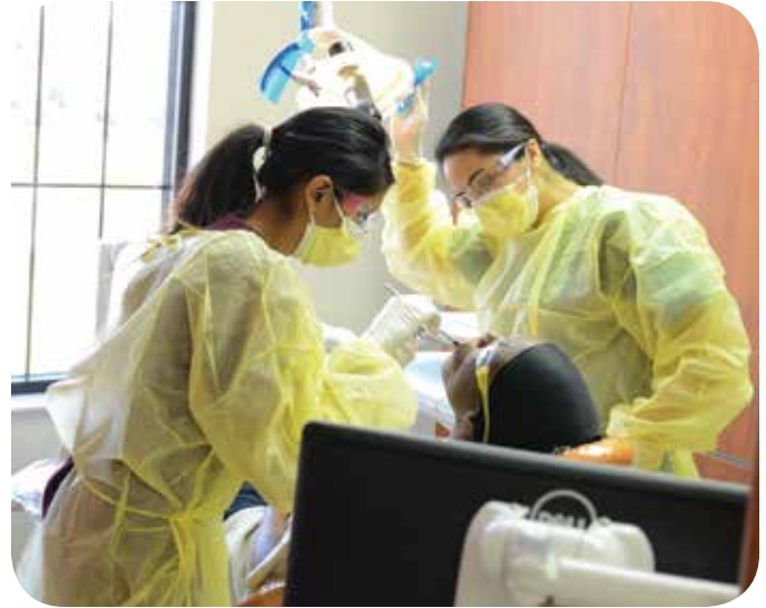
OUHSC dental students participating in the Big Event provide free dental services at the College of Dentistry's community clinic.