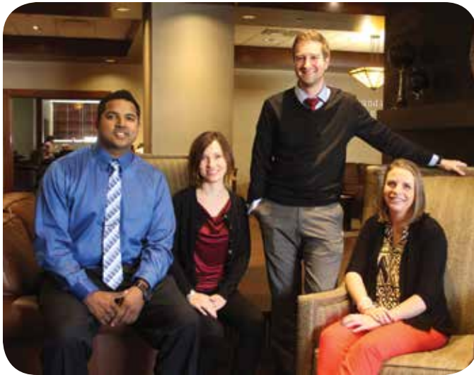
The 2013-2014 OU-Tulsa Student Government Association executive officers gather in the Founders Student Center on Schusterman Center campus.