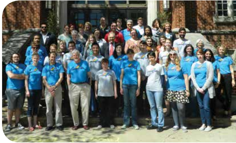
Sooner Allies show their support for LGBTQ students.