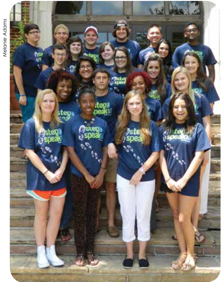
Peer educators of the Step in, Speak out sexual assault prevention team gather at the Oklahoma Memorial Union.

Increase in OUDaily.com advertising revenue