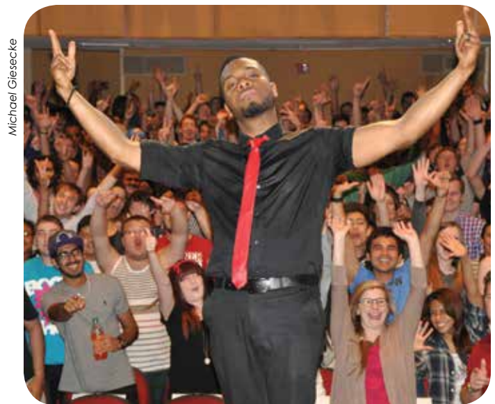
Students take a group selfie with comedian Kel Mitchell at UPB comedy show.