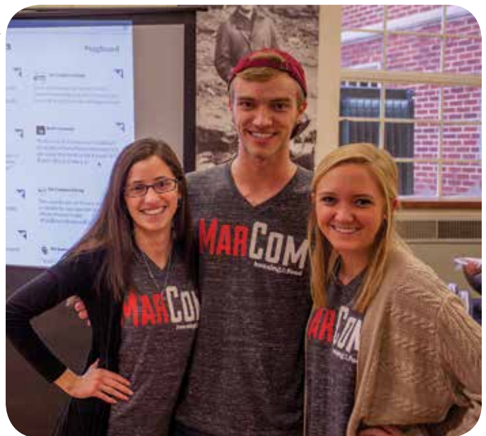
Housing and Food Services MarCom student interns sharpen their marketing and communication skills.