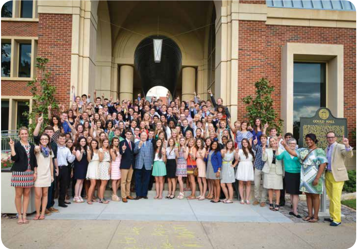
2013-2014 President's Community Scholars