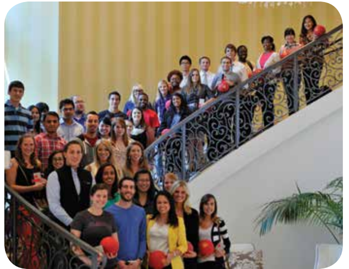
HSC Student Government Association leaders attend the annual HSC Student Leadership Retreat in fall 2013.