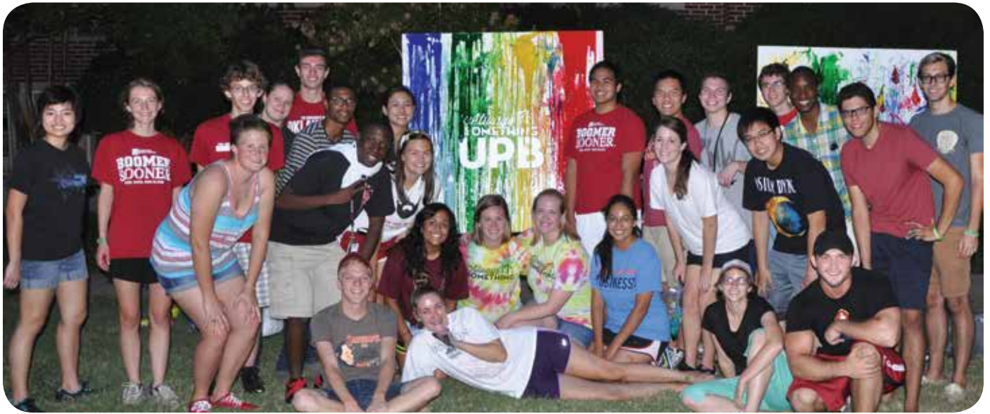
The Union Programming Board's Dye Hard event gives students an opportunity to stretch their creative muscles.