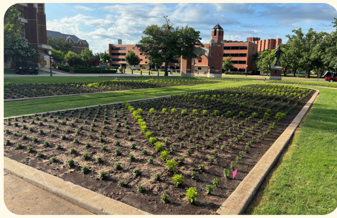
Landscape Services - South Oval Mum Planting