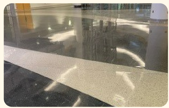
Facility Services - National Weather Center Floor Refinishing