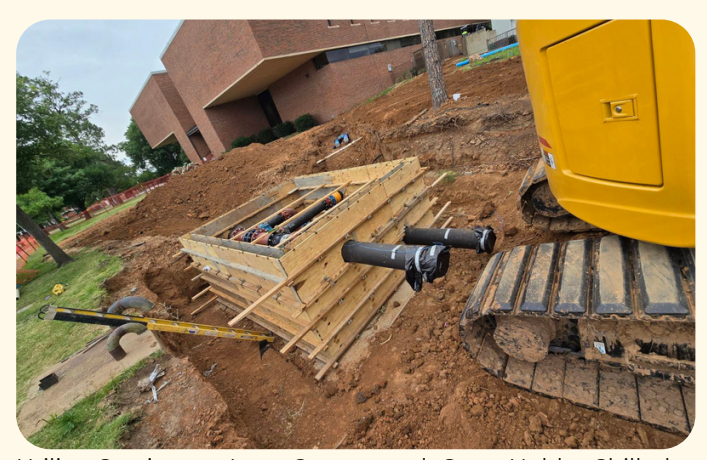
Utility Services - Law Center and Sam Noble Chilled Water Expansion