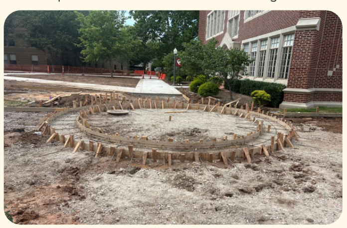
Projects and Engineering - Evans Hall Hedges