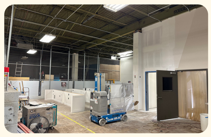
Maintenance Services - 705 Computer Lab