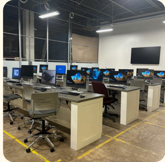
Pictured Above : Computer Lab at 705 E. Lindsey

The computer lab is now open! The Project Office and Maintenance Services completed a renovation of the ACM shop to a computer lab at 705 E. Lindsey. The computer lab will be used for daily computer access, as well as a variety of online trainings. A calendar is now available in Outlook under the name FM 705 Computer Lab for teams who would like to reserve this space for trainings. Please remember to refrain from reserving this room between 7:30 AM – 8:00 AM and 3:30 PM – 4:00 PM, if possible, as it is heavily utilized during these times. Thank you to all the teams who contributed to the creation and development of this space for our department. We look forward to the many learning opportunities this space will offer in future!