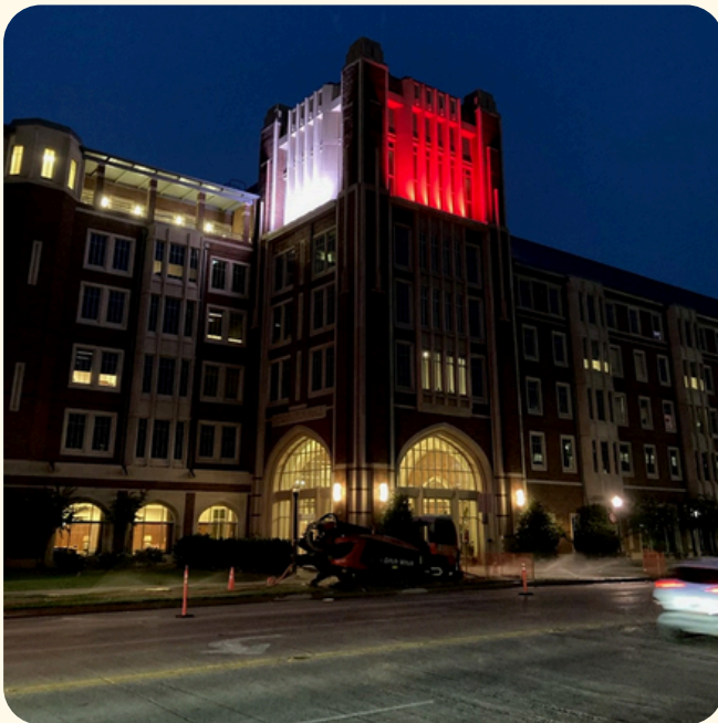
Pictured Above: Headington Hall lighting at night

Lumenpulse provided custom electronics to control the new lights, and the FM Electric team worked some evening hours to meet with their technician to upload and fine-tune the system programming. Now, the lights can be controlled via a touch screen in the building, and the setup includes several different color schemes. The Electrical team made sure everything was up and running before the first football game, so it was ready for the season. Great job, Electrical shop!