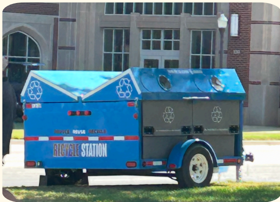
Pictured Above: One of the two blue recycling trailers temporarily resides on Lindsey Street to accommodate tailgaters and football fans heading to the game.

The addition of the trailers marks another step toward enhancing the university's sustainability initiatives, making recycling more accessible and visible to the campus community.