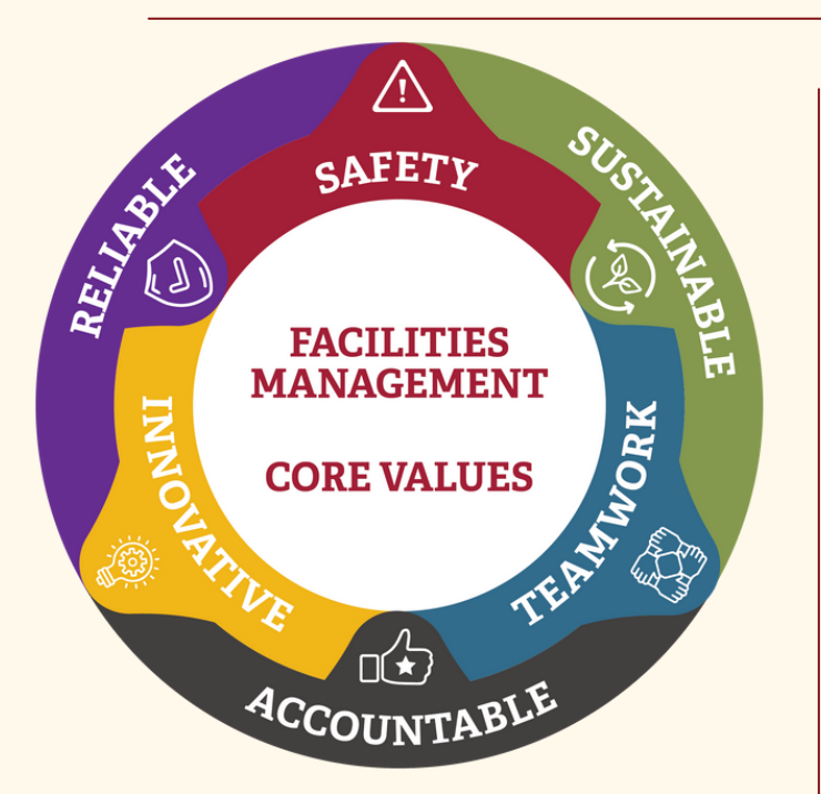
Pictured: OU FM Core Values logo designed by OU Printing Services.