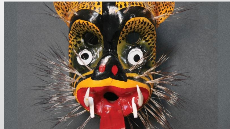
Mexie – Art Museum