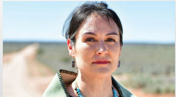
Saying Hello in Navajo