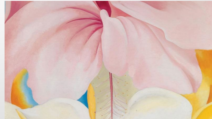
Georgia O'Keeffe Paints Hawaii