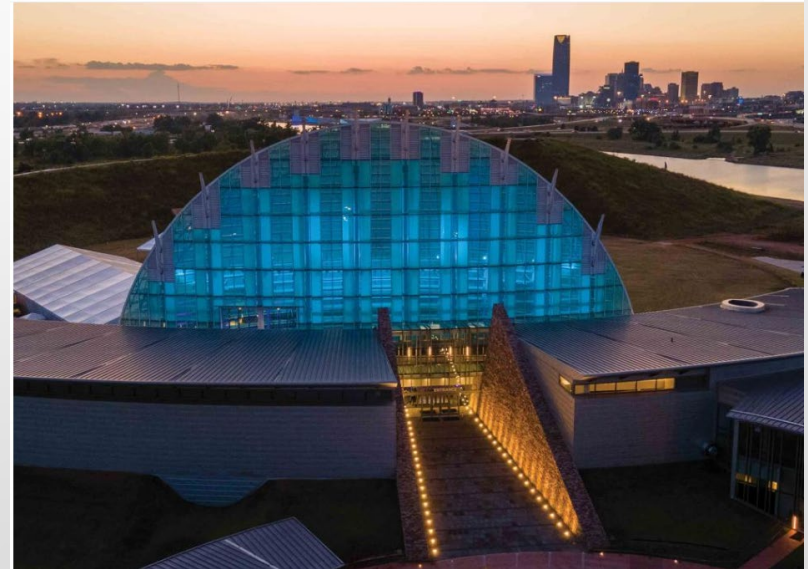
First Americans Museum - Oklahoma