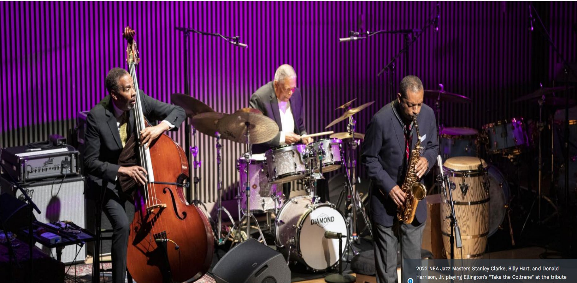
2022 NEA Jazz Masters Stanley Clarke, Billy Hart, and Donald Harrison, Jr. playing Ellington's "Take the Coltrane" at the tribute