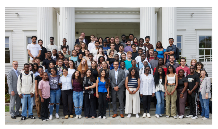
RECAP OF OUR BOYD HOUSE RECEPTION WITH PRESIDENT HARROZ