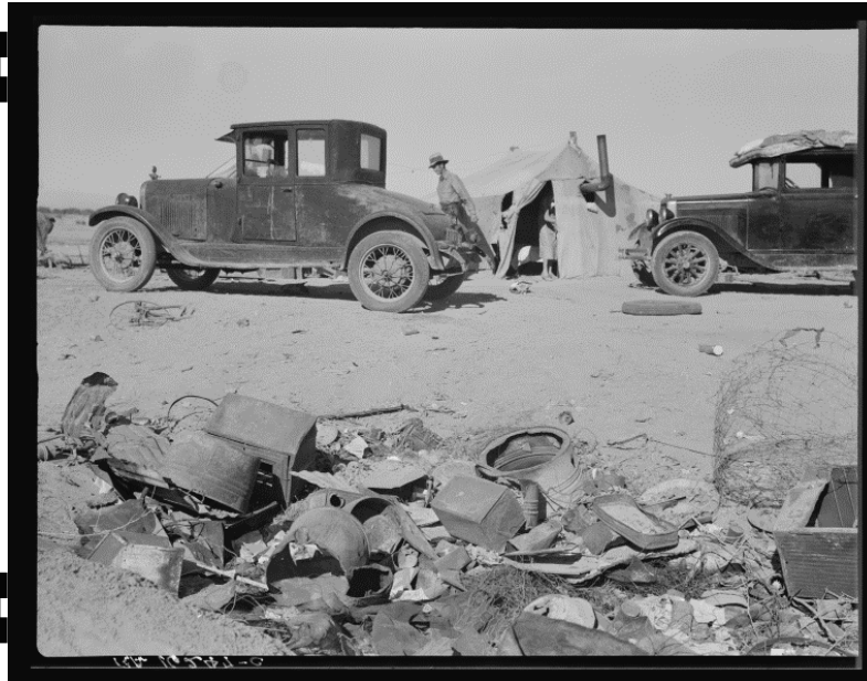
Dorothea Lange, "Refugee Families Encamped Near Holtville, California." March 1937. Library of Congress, Prints and Photographs Division, FSA/OWI Collection [LC-DIG-ppmsca-12884].