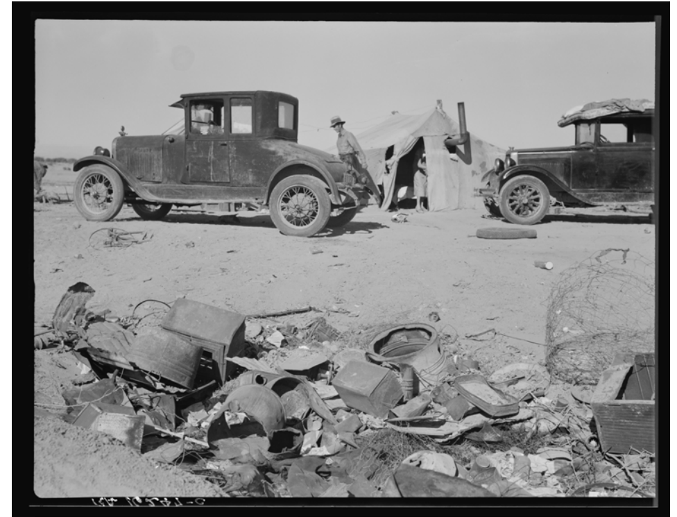
Dorothea Lange, "Refugee Families Encamped Near Holtville, California." March 1937.

The University of Oklahoma is an equal opportunity institution. www.ou.edu/eoo