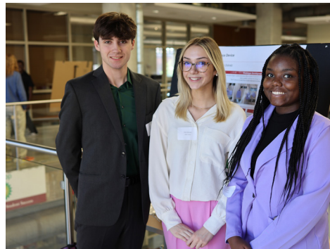
Students present their design project in the first year BME design course.