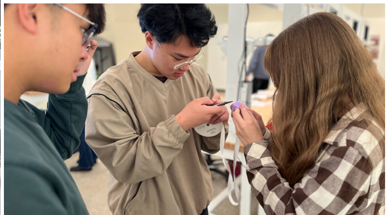
First year BME students work together to create a prototype for their design project

Cytovance Biologics Oklahoma City, OK Process Development Associate