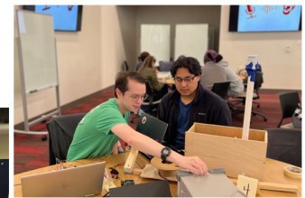
Students working together to design a prototype for their capstone project.

“The Biomedical Engineering program is one of the best programs at OU. I gained valuable experience through outreach events, networking opportunities, and undergraduate research programs. Students get to know their instructors on a deeper level, which further improves professional development and networking opportunities. Ultimately, the immersive programs, interactive courses, and friendly faculty help prepare students for their future prospects, including areas like graduate school, medical school, and industry.”