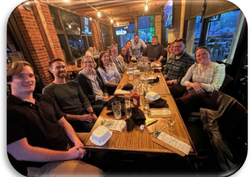
Dialogues of Contemporary Sociology [DOCS] end-of-year party (May 2023)