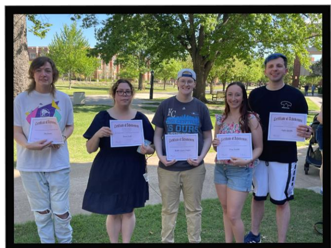
Grasmick-Riddle Summer Research Fellowship Award Winners, Spring 2023