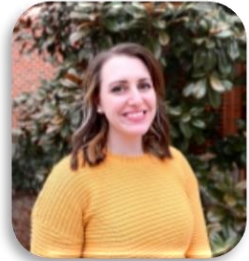
Sally Wiser Illicit Masculinity: Examining Gender Differences in Adolescent Drug Use