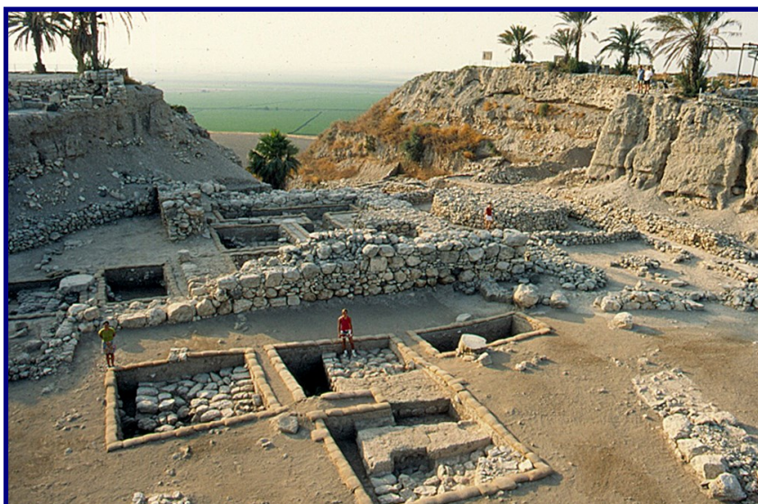
Megiddo Excavation Site 2013