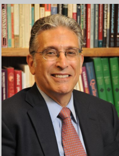
Norman Stillman Jews/Christians Under Islam Spain Under Islam