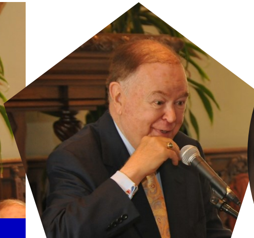
President David L. Boren