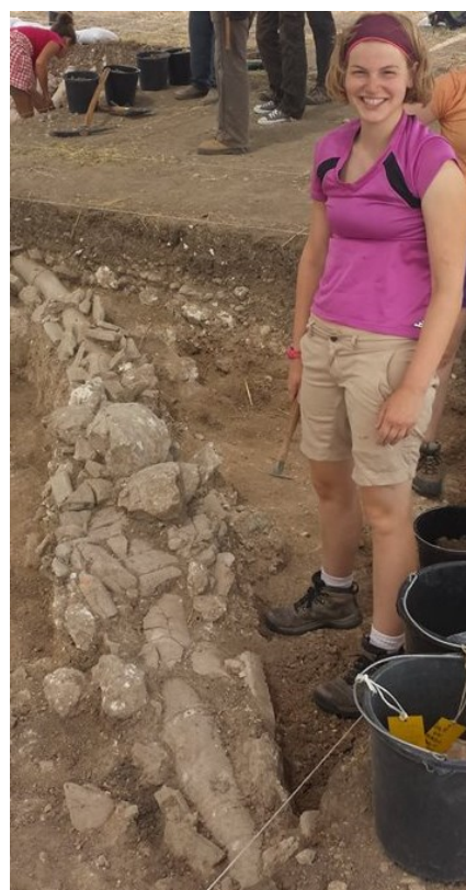
Students discover drainpipe

We are just beginning to uncover the Roman camp in this summer's excavations and we eagerly anticipate the discoveries to come, about which I will report in the next newsletter!