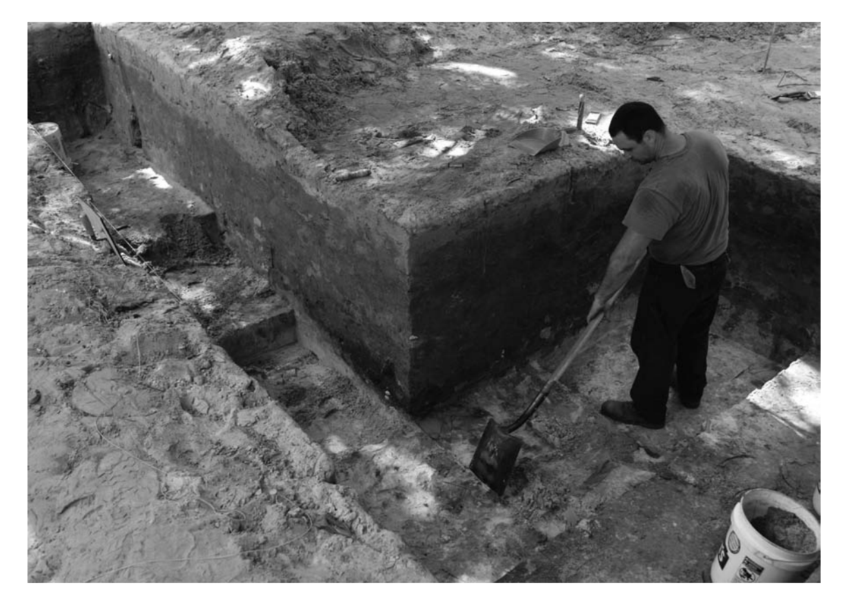
Figure 6. Micah Monés excavates a final level in the excavation block at Parnell Mound alongside a remaining portion of the three meter long profile of Feature 1.

One area of concentrated investigations is the remnants of a 200-m long shell ridge, referred to as Locus A. Our prior excavations demonstrated that shell mining left intact escarpments on the margins of the mound. When cut back and excavated down to basal deposits these 3-m deep profiles provide windows into the mound's history during the Mount Taylor period. This season, we shifted strategies and excavated five 2-x-2-m units arranged in a 6-x-4-m block with the goal of delineating architecture and affiliated features. These units intercepted 1.5-m thick basal deposits not impacted by the mining process. The search for discrete habitation spaces did