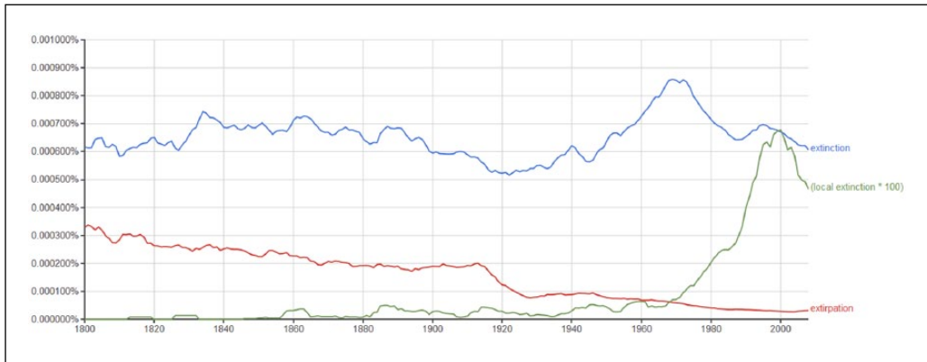
Figure 3. Prevalence of the terms extinction , extirpation , and local extinction (note the different scale), per Google's ngram (run 14 January 2015), from 1800 to present. Usage of extinction has been more or less stable, usage of extirpation has declined steadily, and usage of local extinction spiked upward beginning in the late 1960s.

Change in usage of words is expected in any language. English always has been and always will be a moving target. Given this reality, it is easy to argue that we ought to accept change in use of extinction as inevitable and move on with our lives. But it is not that simple. As with the words irony and unique , whose usage is changing slowly from a specific meaning to something more nebulous (O'Conner and Kellerman, 2009), the word extinction has no true synonym in English. If the specific meaning of extinction vanishes, we cannot fall back on another word that has the same meaning. Our only recourse is to clutter the language with modifiers. Needless clutter is bad enough, and something we all ought to eschew, but the term extinction is used in so many different ways now that it is nearly, if not already, a panchreston (Cottee-Jones and Whittaker, 2012). As such, extinction without a modifier is used frequently when extirpation is meant. As an example, a random selection of a mere five recent studies of avian response to deforestation yielded 158 species of Neotropical birds that were designated as extinct even though all of these species are extant, and 92% are classified by the IUCN as being of "least concern" (Figure 1).