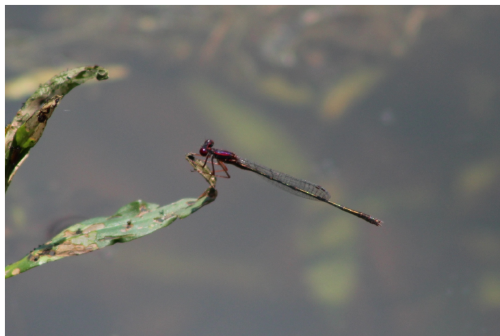
Not great photos, but you get the idea. Here is a single male (above) Burgundy Bluet and one of the pairs (below).

Thoroughly disenchanted, we headed north into the Ouachita Mts. En route we decided to pop in to the lake in the city park in Broken Bow, a place we had visited in 2003 and 2004 and remembered fondly enough. Imagine our shock when we walked to the lily pads at the shaded north end of the lake and, separately—we were standing several meters apart—spotted our very own male Burgundy Bluet! We were almost too giddy for words. We secured a specimen and lots of photos. As we carefully searched this shore of the lake, we counted some 25 males, including a teneral, and found two tandem pairs. There's a population in the state after all!