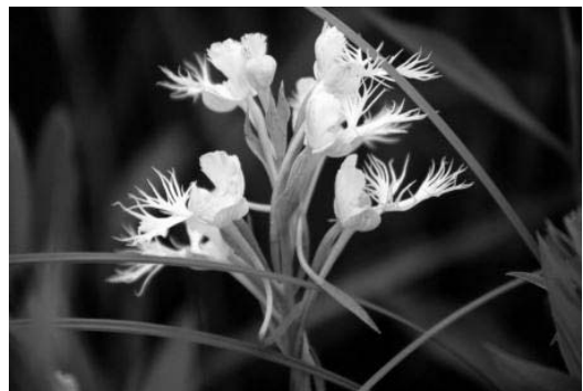
The western prairie fringed orchid.

Missouri, Nebraska, North Dakota, and Oklahoma. Pressures on populations include land conversion, overgrazing, poaching, suppression of natural fire regimes, and herbicide use. Herbivory, invasives, and the species' erratic flowering patterns also are concerns. A final factor adding to the plant's vulnerability is its reliance on symbiotic relationships with specific fungi. Symbiotic relationships are close associations between different organisms of different species that may benefit each member. This relationship is particularly important for the orchid during seedling establishment, as the plant has no endosperm or seed leaves (cotyledons) to provide energy for growth. Habitat fragmentation has been suspected to lead to the loss of the orchid's mycorrhizal symbionts and thus complicate its recovery.