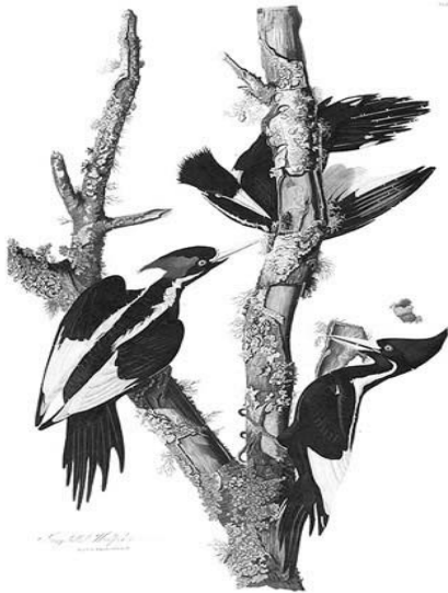
The Ivory-Billed Woodpecker. Watercolor by John James Audubon.