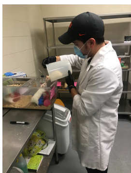
Working with rats on a pilot experiment at OSUCHS

To not be discouraged when asking questions and asking for help. It's ok to not fully know exactly what you want to do in regards to health careers, and don't jump into a field because you know you are smart or because it is lucrative. Take your time, try to shadow or interview as many career paths as you can, and refuse to compare your journey to others.