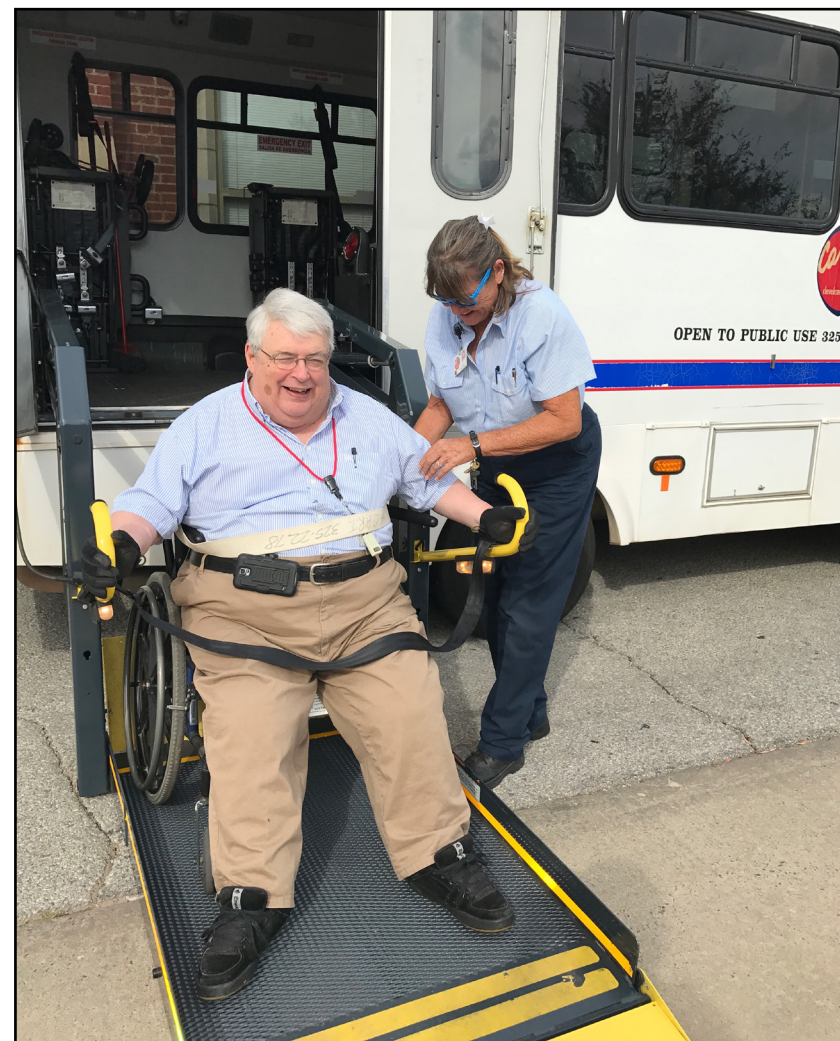
▲ CARTaccess operator secures a passenger onto the lift before his ride home from the University of Oklahoma.

When a customer is a no-show for one trip, CART will attempt to contact the customer to inquire about the return trip if the customer does not contact CART within one hour after the no-show. However, if CART is unable to reach the customer, the trip will be canceled to avoid the cost of sending vehicles unnecessarily and penalizing