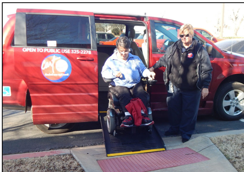
▲ CARTaccess operator lowers the ramp for a passenger.

after office hours on the same day of the scheduled ride. In that situation, call the CART emergency phone number at (405) 760-9361. That is the ONLY instance in which this number should be utilized. However, if the cancellation is made two hours or less prior to the pick-up time, the trip will be treated as a no-show.