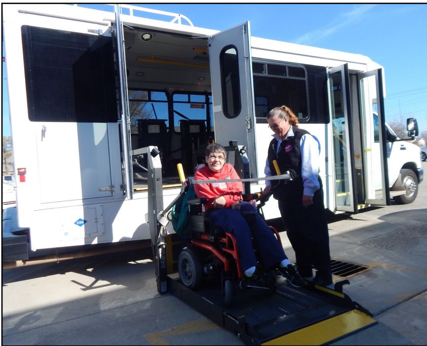
▲ CARTaccess operator secures a passenger before lifting her into the CARTaccess van.

Zone only. A subscription eliminates the need for advance reservations for each trip. A customer may request a subscription or standing ride after booking the same ride for two weeks in a row. If no cancellations, no-shows or changes have occurred within this time period, the ride request may become a subscription. Secondary Zone customers are not eligible for subscription service.