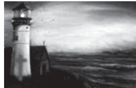
Matthew 5:14 “You are the light of the world, a city on a hill cannot be hidden.