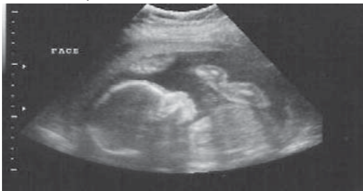
40,000,000 abortions within the last 30 years.