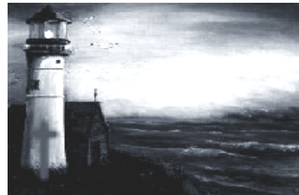
Matthew 5:14 "You are the light of the world, a city on a hill cannot be hidden.