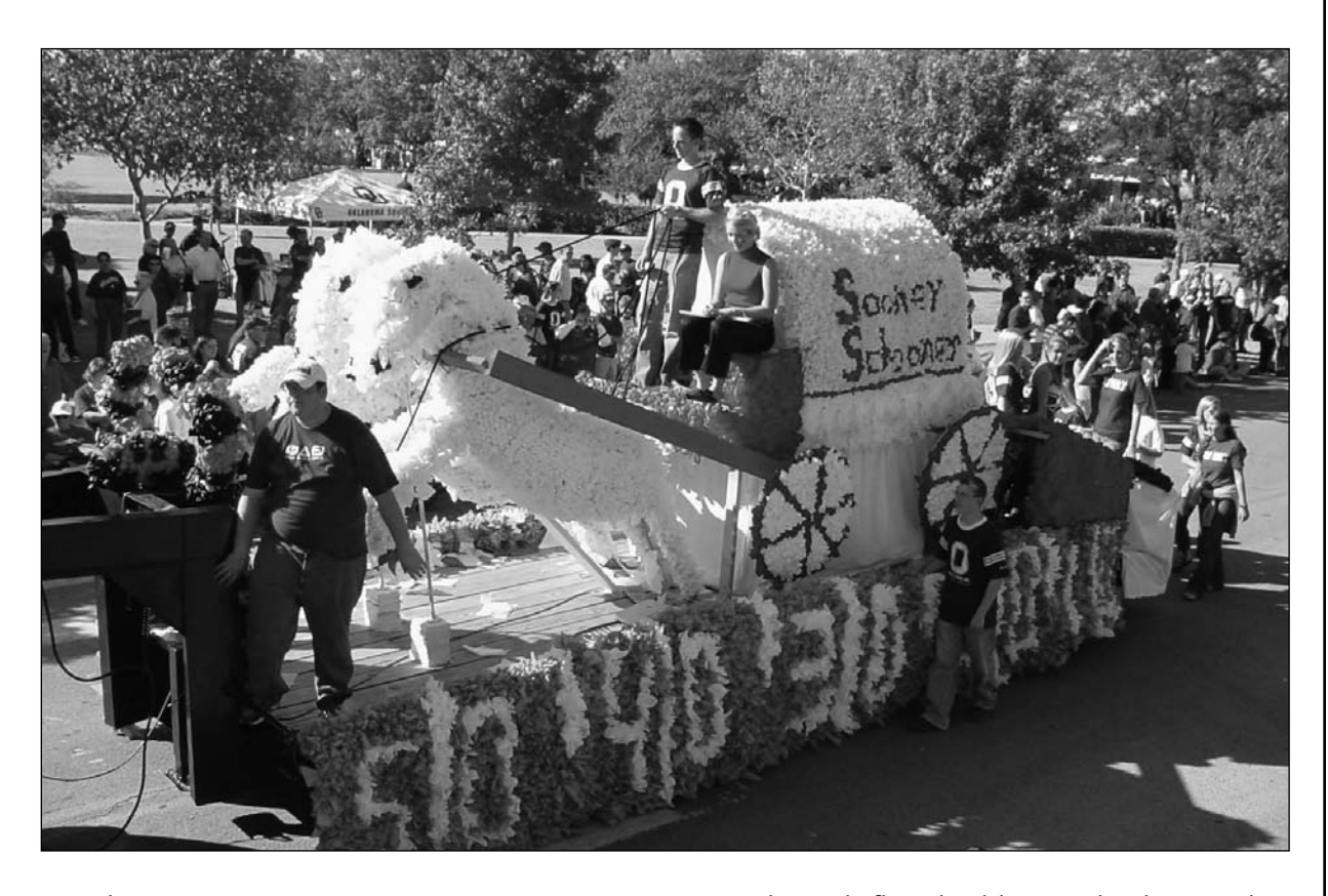
Student groups participate in Homecoming activities through float building and riding in the Homecoming parade.

"Never, Never, Never, Never, Never, Never Give Up!" —Winston Churchill