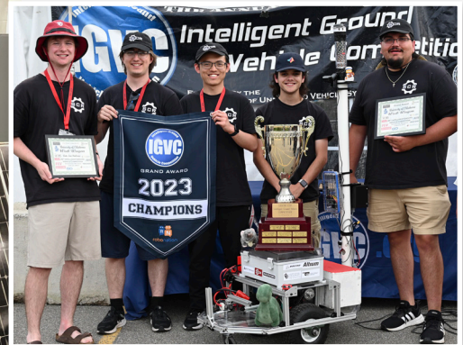
Sooner Competitive Robots team at competition.

“The Electrical and Computer Engineering program at OU has given me a fulfilling experience in pursuing my dream career in robotics. The faculty has your success in mind, and I have had the opportunity to take classes in interesting fields such as microprocessor system design, VLSI digital system design, artificial intelligence, and digital signal processing. By incorporating experiential learning into the curriculum and being able to practice engineering on a competition team such as Sooner Competitive Robotics, the ECE program has given me the confidence to apply the knowledge learned in the classroom to real world settings.”