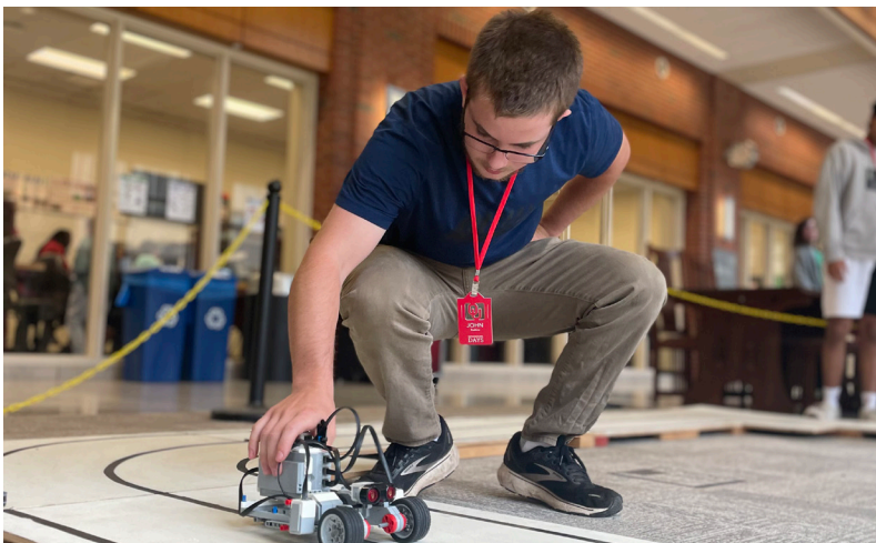
Student participates in hands-on projects during the OU Engineering Days summer camps.

3 One of the critical aspects of any undergraduate engineering program centers on its teaching lab sequence, which provides the knowledge and skills necessary to compete in the job market and to solve today's challenging problems. We provide a strategically designed lab sequence that carefully leads students through an introduction to digital circuits, analog circuits and electronics, advanced digital design, and terminates in a senior-level, real-world capstone project.