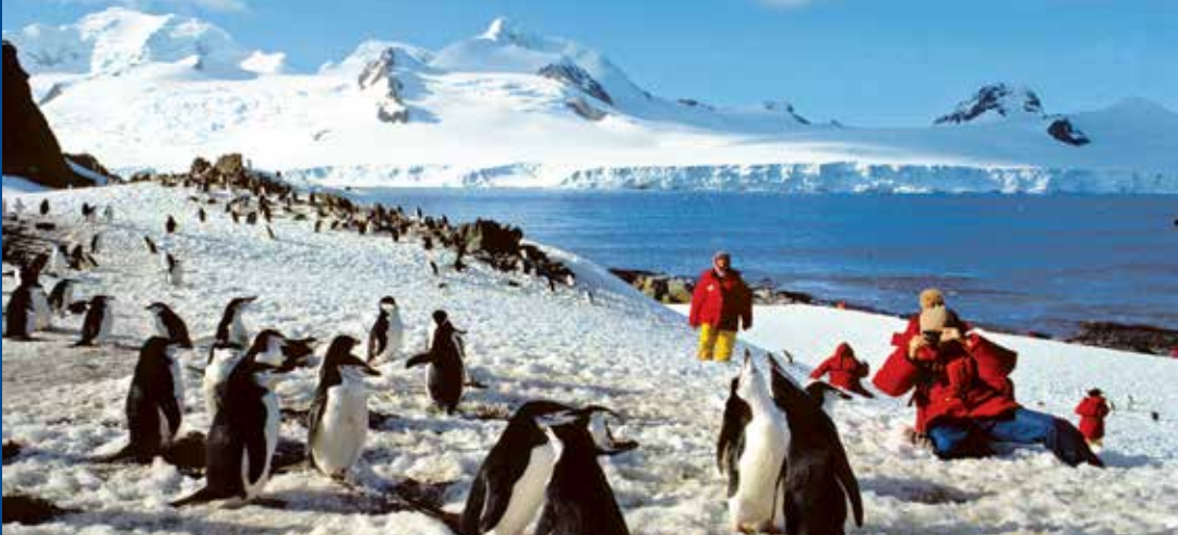
Enjoy an up-close, unparalleled view of chinstrap penguins in their natural Antarctic habitat.

marine wildlife including humpback whales, crabeater seals and Cape petrels.